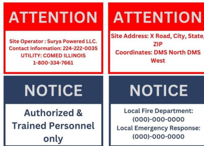
Photo 1. Example of signage proposed along the project fence.

Signage with emergency contact information will be fixed on the project fence near the gate of the facility. This signage will detail the contact information of the site operator, the utility provider, the 911 address of the appropriate AHJ, and site coordinates. Below is a sample of the fixated signs on the fencing.