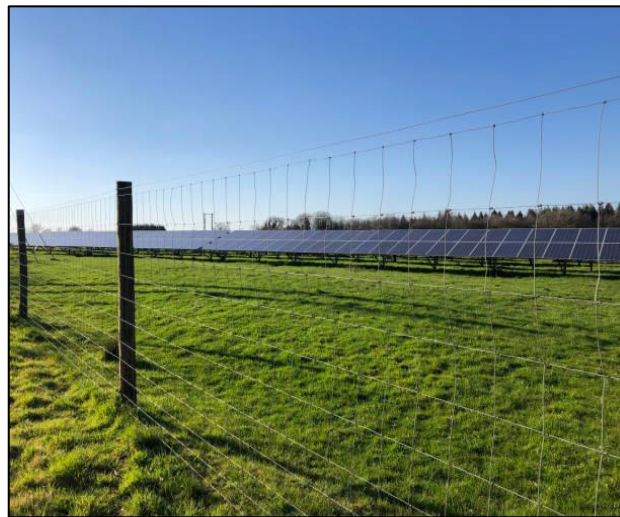
Photo 3. Example of Fixed Farm Knot Fence on Solar Site

The proposed facility is planning to construct a fixed knot farm fence: