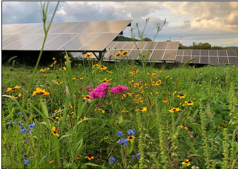
Photo 4. Pollinators on a solar site

Proposed pollinator-friendly wildflowers to minimize weeds and erosion for the life of the Project.