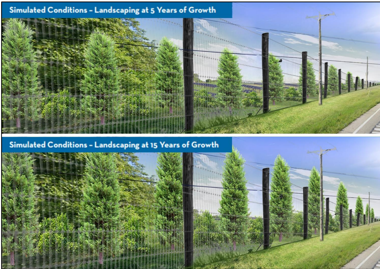
Photo 7. Rendered Image of Vegetation Buffer, Fixed Farm Knot Fence (8 ft tall) and Solar Panels (50 feet setback back property line. Simulated at 5-year growth and 15-year growth.