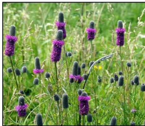
Purple Prairie Clover